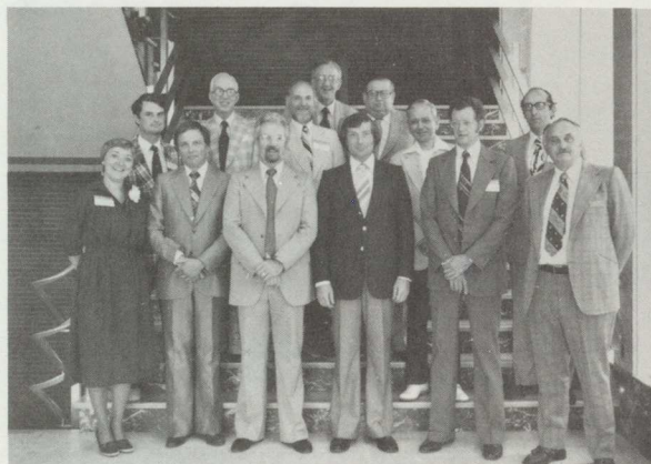
1977 Great Lakes Water Quality Board

and the posting of bonds by generators, carriers and disposers of hazardous wastes. The Board recommended that both countries develop national programs which would permit interjurisdictional movements of hazardous wastes.