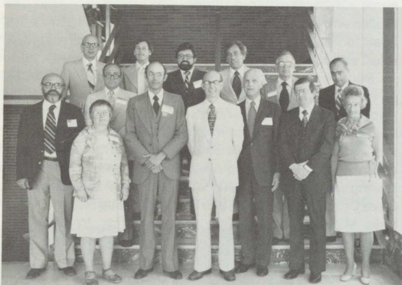
1977 Great Lakes Research Advisory Board

itself it can be misleading and could hinder achievement of the full understanding necessary for effective management of the restoration and enhancement of the Great Lakes.