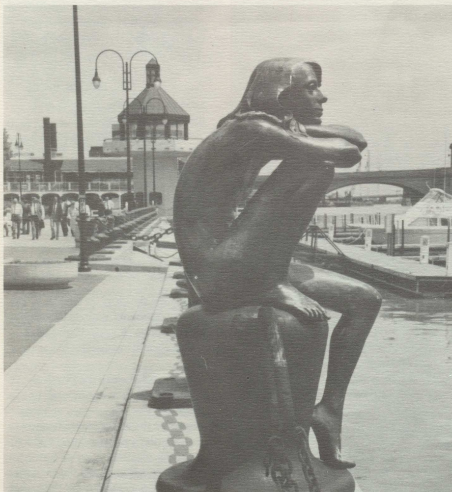
Toledo's recent revitalization has provided many opportunities for residents and visitors to enjoy the city and the Maumee River.