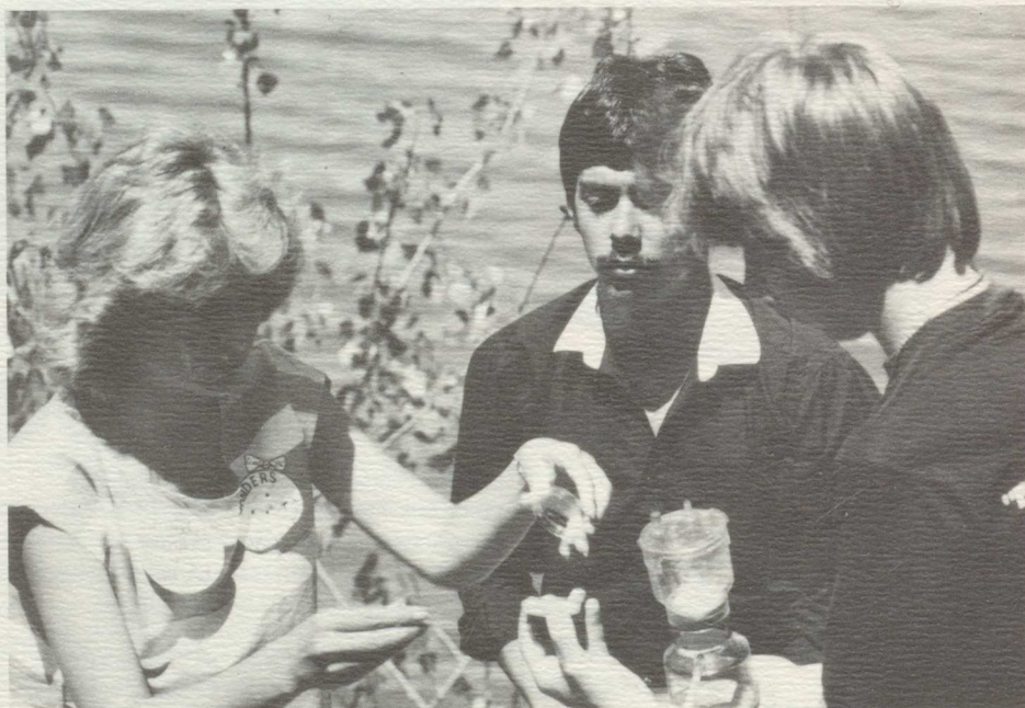
Students collected water samples, tested them, and analyzed results during the two-week project.

That kind of commitment was clearly evident when students and teachers from all 16 schools gathered for a one-day workshop May 16, 1987 to compare results of their investigations and discuss possible solutions to the pollution in the Rouge River. Sources of pollution along the river were identified as increased urban runoff, which contributes salt and motor oils; combined sewer overflows (CSOs), some of which were found to be illegally contributing pollution into the river even in dry weather periods;