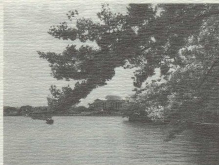
The cherry blossoms were in full bloom during the IJC's Semi-Annual Meeting.