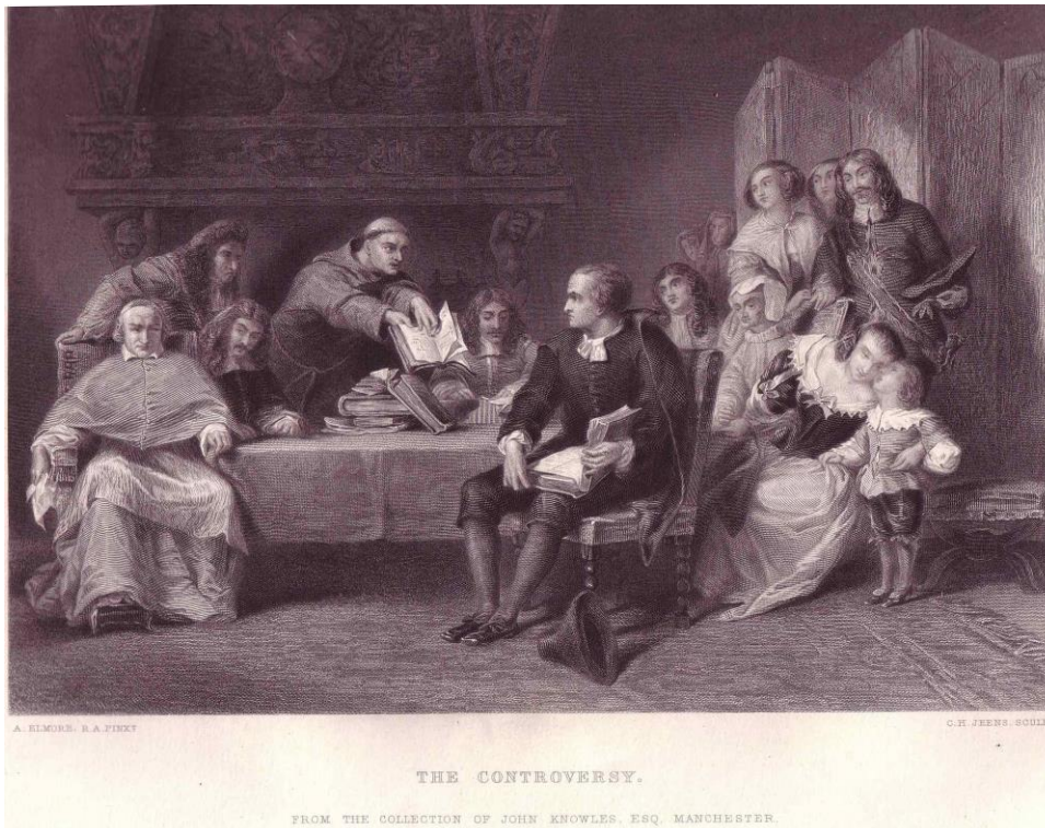
Figure 3: Jeens (1827–1879), The Controversy , 1868. 3

If argumentative theories are to be relevant to actual uses of arguments, they cannot deal with the lessons of skepticism by claiming that skepticism is unconvincing, counter-intuitive, or by disregarding the demands of our ordinary concept of knowledge. There is no way but to acknowledge that there is no 'objective' justification for knowledge-claims that will stand the counter-arguments of skepticism. However, by adopting the humanistic approach to argumentation as a necessary condition for any argumentation theory, two goals can be satisfied: First, a normative approach to argumentation, which acknowledge its origin and essence as a choice for a democratic form of life. Second, defining guiding rules for possible methodologies and aims that will be consider legitimate for argumentative theories, and will term these argumentative theories humanistic .