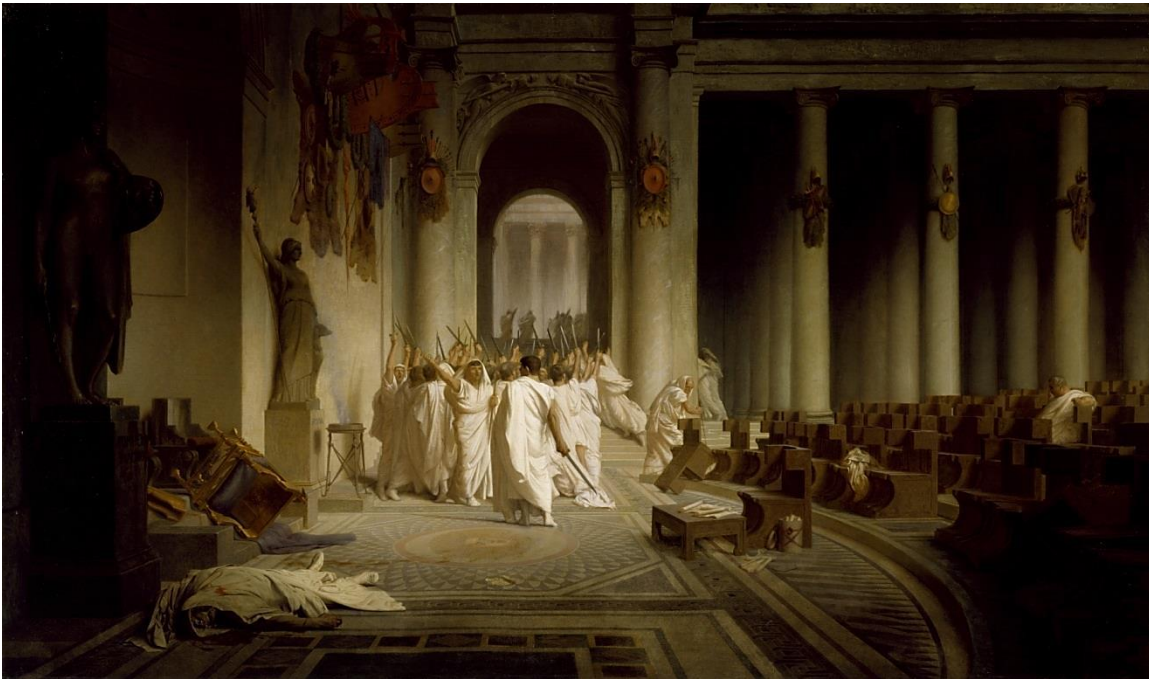
Figure 2: , Jean-Léon Gérôme, The Death of Caesar (1867). 2

They are normative in nature since they are contrary to human actuality and history. Needless to say that the common way to resolve controversies is by the use of force and violence, and probably it is also the most effective one. Some of the Sophist philosophers came to this conclusion, such as Callicles or Thrasymachus. Callicles argues that it is an anthropological and social fact regarding human nature as such. Thrasymachus goes even further and turns this observation into a moral statement by arguing that the ability to force something is the criterion for its being justified (Barney, 2004). See also (Bett, 2002; Dillon & Gergel, 2003). Political murder is an instance to such a view, in which the use of violence is intended to cause an important political change. Caesar's murder in the Roman senate hall is an instance to such an act and an ironic instance as well (Canfora, 2007), as is well dramatized in Shakespeare's Julius Caesar (Taylor, 1973).