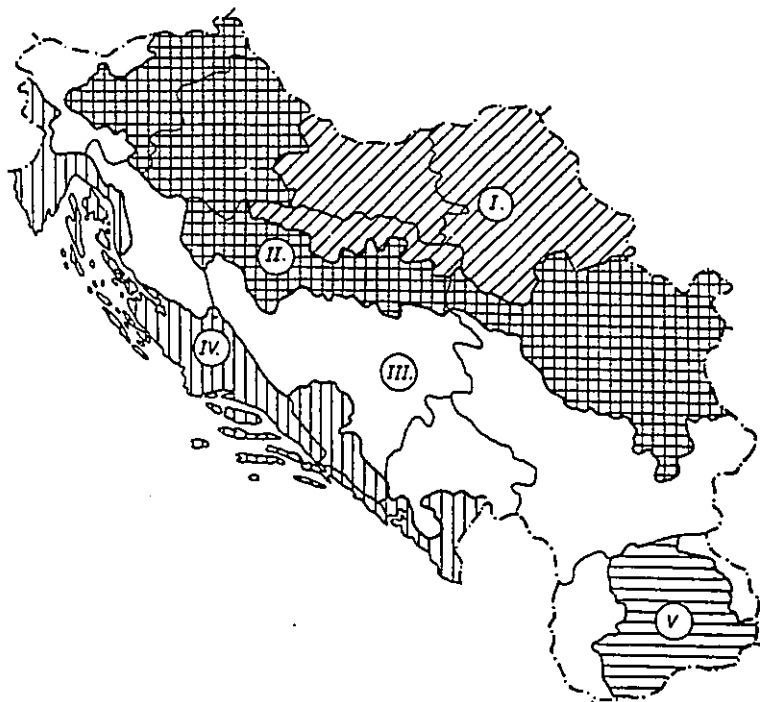
Fig. 2.2 Agricultural Regions of Yugoslavia

I. Plains II. Hills III. Alpine IV. Adriatic V. Subtropical