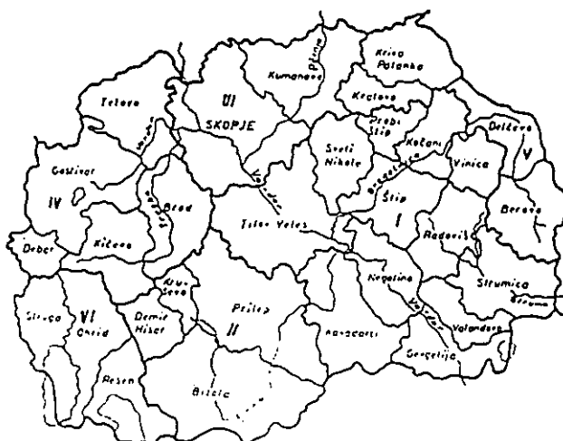
Fig. 2.3 Agricultural Regions of SR Macedonia

I. Plains II. Hills III. Alpine IV. Adriatic V. Subtropical