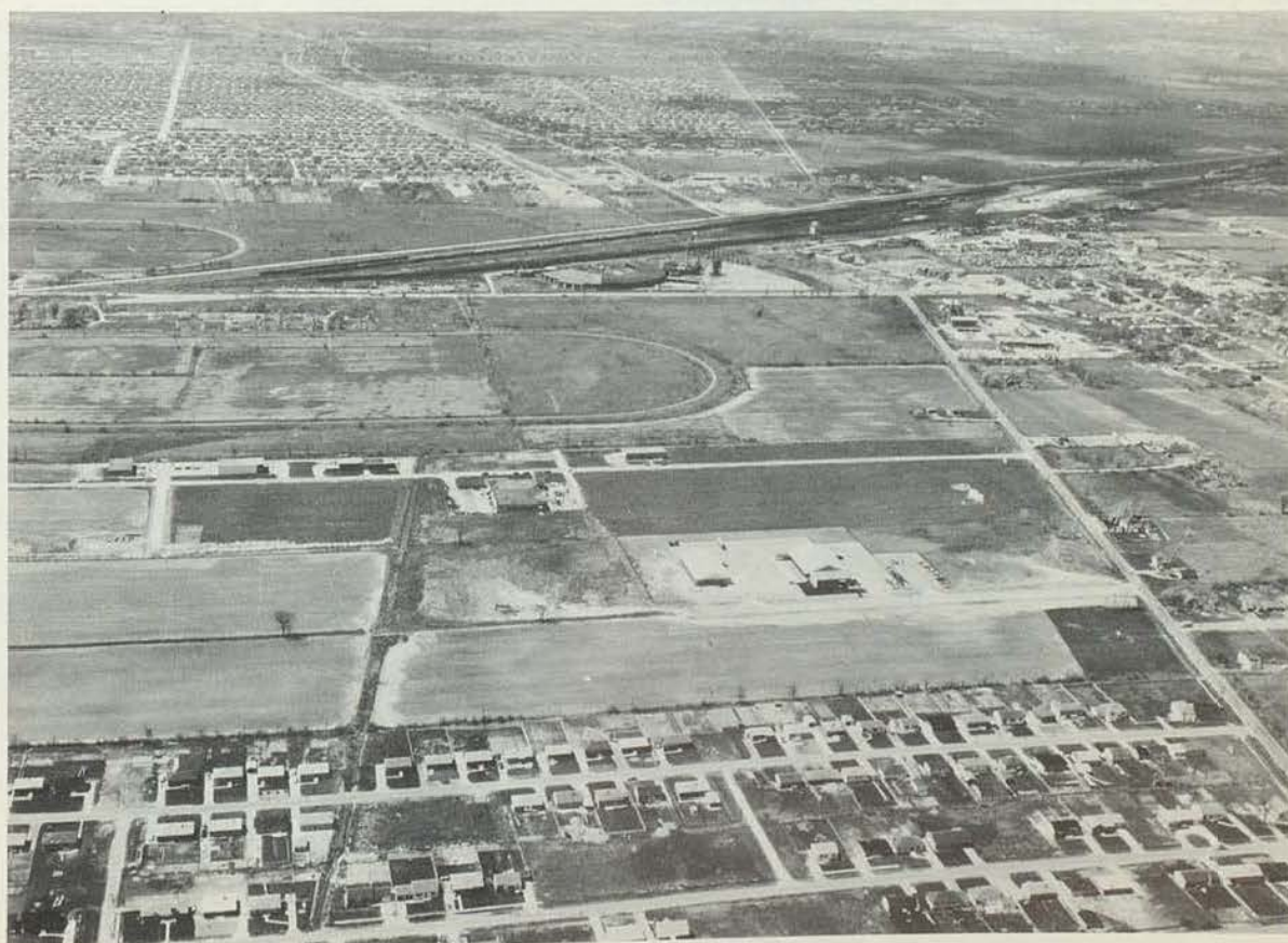
DEVON INDUSTRIAL PARK IN SANDWICH EAST TOWNSHIP IS OCCUPIED BY CANADIAN MECHANICAL HANDLING SYSTEMS LIMITED, LINCOLN CASKETS LIMITED, WELTRONIC (CANADA) LIMITED AND LOCATED WITHIN THREE MILES OF WINDSOR'S MODERN AIRPORT.