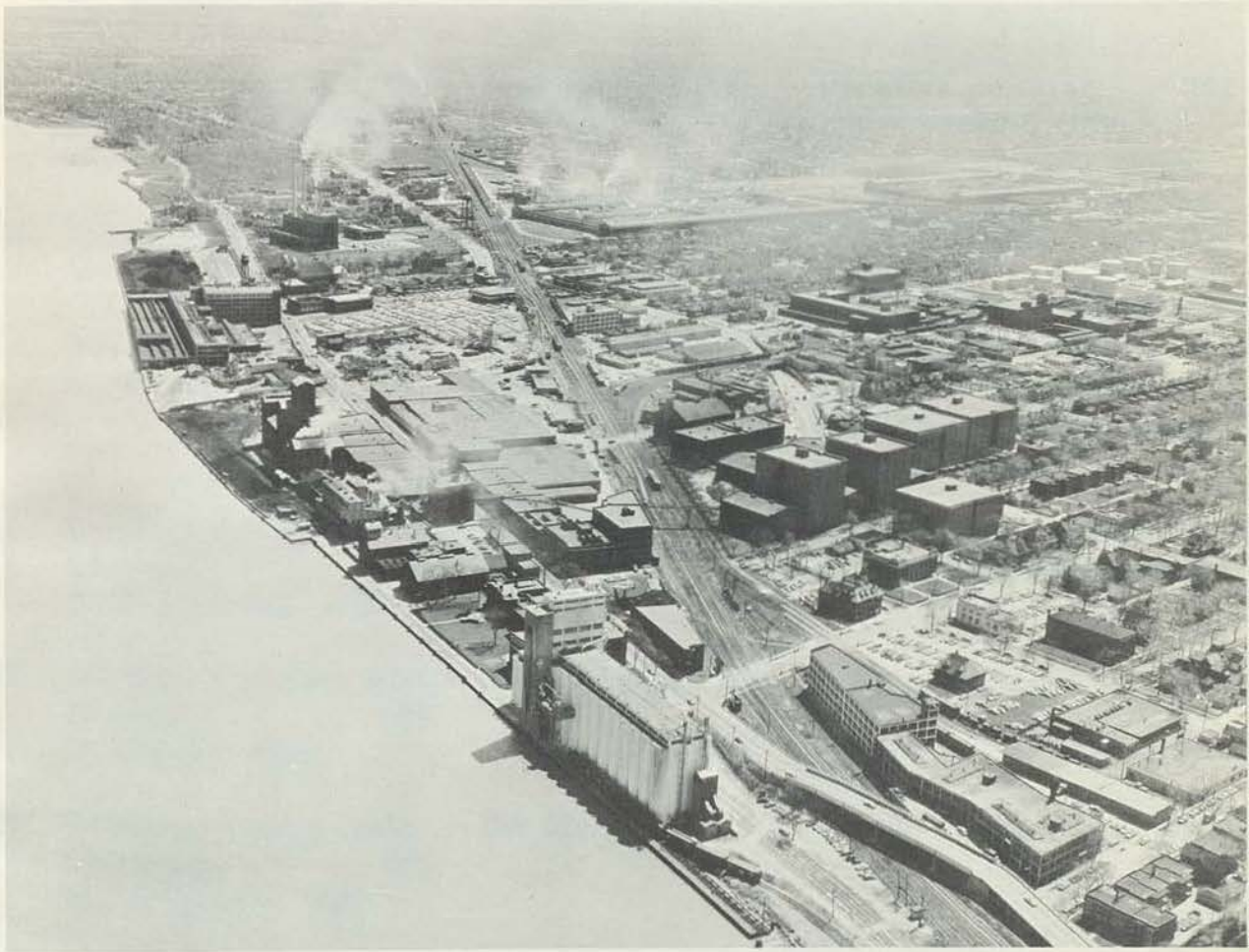
PART OF GREATER WINDSOR'S INDUSTRIAL COMPLEX SHOWING HIRAM WALKER AND SONS LIMITED IN THE FOREGROUND AND THE FORD MOTOR COMPANY OF CANADA LIMITED IN THE BACKGROUND.