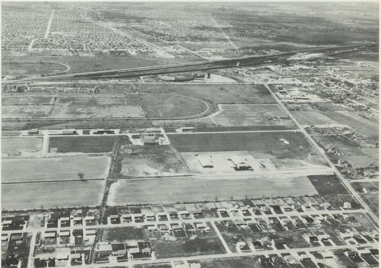
DEVON INDUSTRIAL PARK IN SANDWICH EAST TOWNSHIP IS OCCUPIED BY CANADIAN MECHANICAL HANDLING SYSTEMS LIMITED, LINCOLN CASKETS LIMITED, WELTRONIC (CANADA) LIMITED AND LOCATED WITHIN THREE MILES OF WINDSOR'S MODERN AIRPORT.