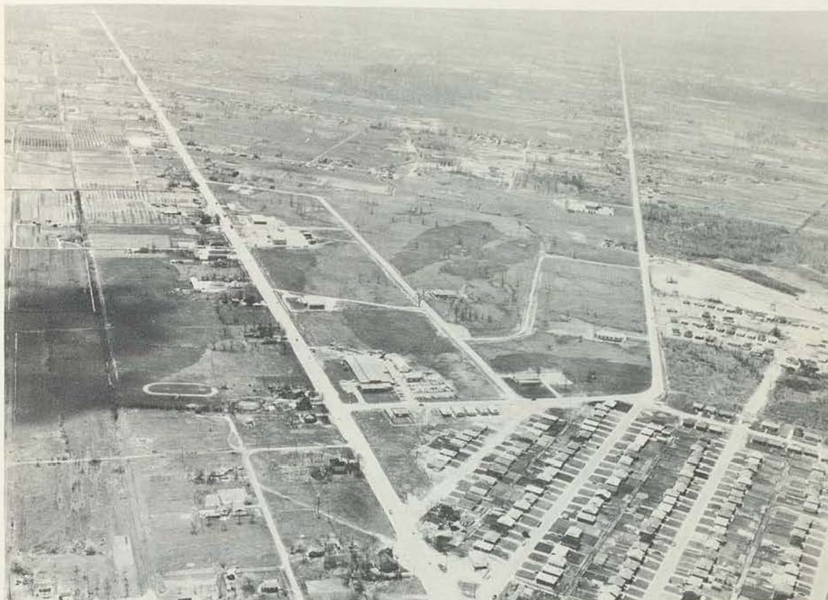
THE SANDWICH WEST INDUSTRIAL PARK IS DEVELOPING RAPIDLY WITH MODERN ATTRACTIVE PLANTS, SUCH AS INTERNATIONAL TOOLS LIMITED, SHERMAN LABORATORIES, ROBOTRON OF CANADA LIMITED, CANADIAN TRAILMOBILE LIMITED, CRESCENT TOOL AND DIE LIMITED AND A. A. FELDMANN WINDOW CO.