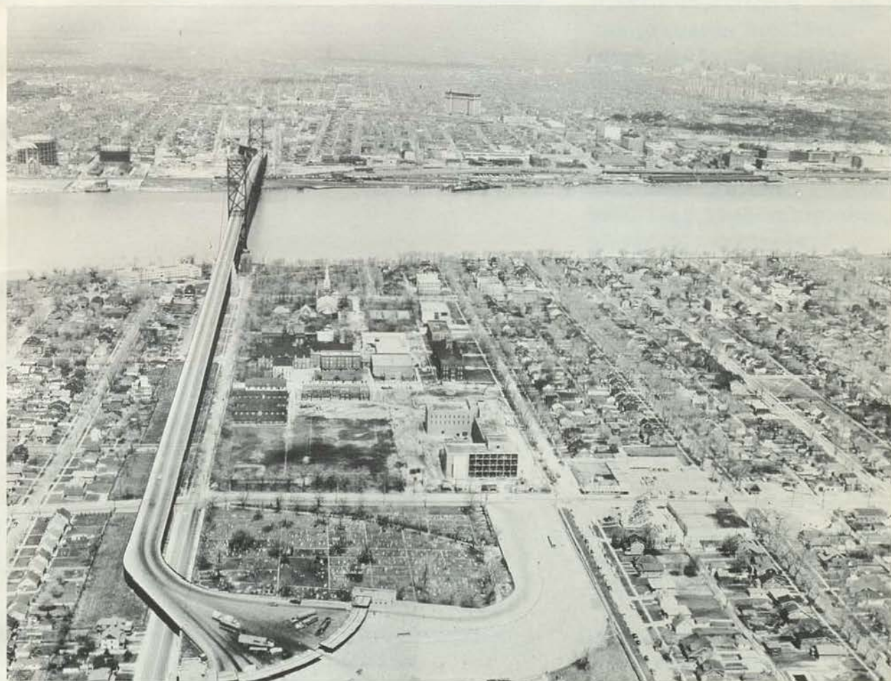
ASSUMPTION UNIVERSITY OF WINDSOR IS THE WORLD'S FIRST ROMAN CATHOLIC UNIVERSITY TO HAVE AN ANGLICAN COLLEGE, CANTERBURY, AND A NON-DENOMINATIONAL COLLEGE, ESSEX, IN AFFILIATION. THE AMBASSADOR BRIDGE TO DETROIT IS ADJACENT TO THE UNIVERSITY.