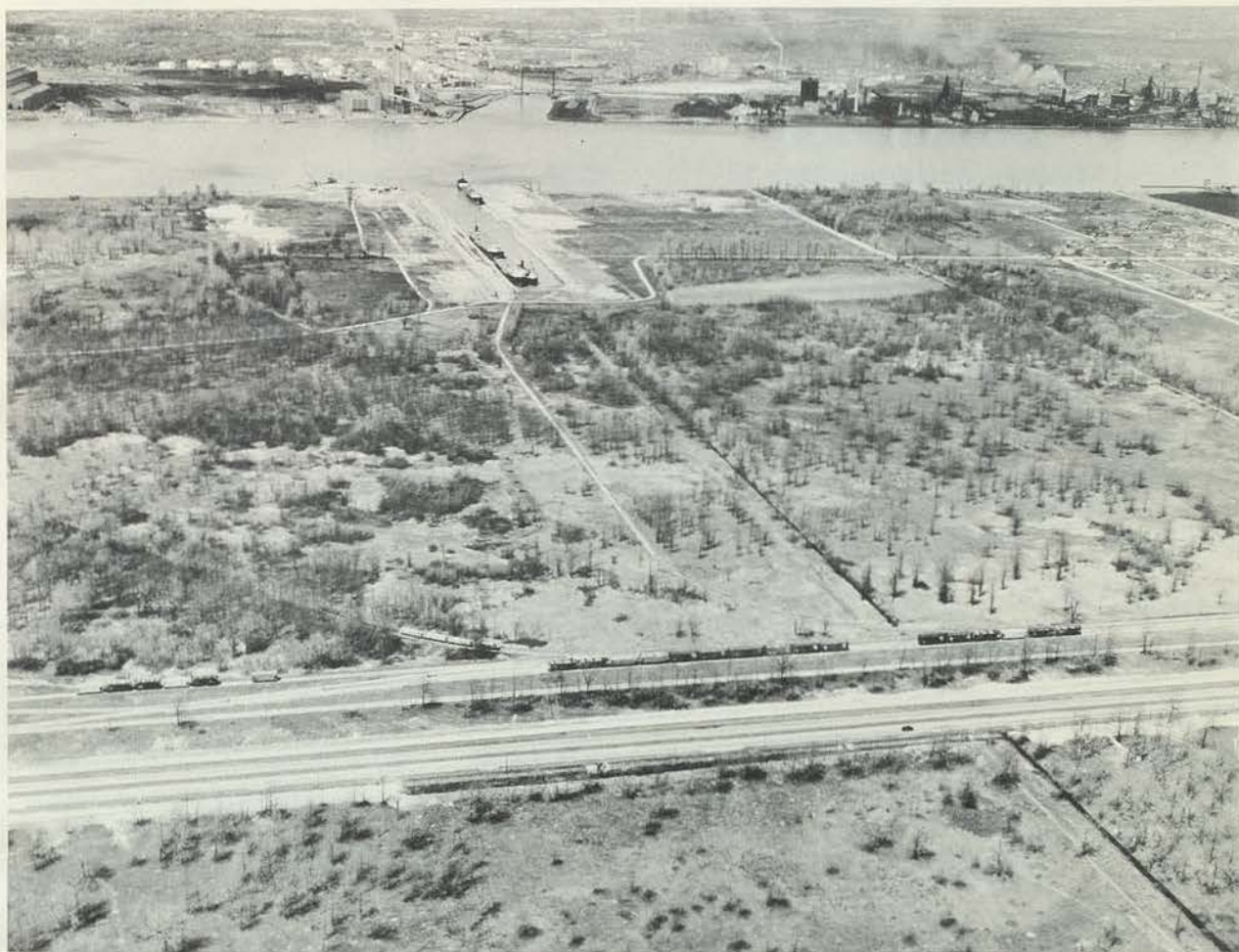
AN AERIAL VIEW OF PART OF THE TOWN OF OJIBWAY, 1800 ACRES OF INDUSTRIALLY ZONED LAND UNDER ONE OWNERSHIP, LOCATED ON THE GREAT LAKES, ST. LAWRENCE WATERWAY, AND SERVICED WITH POWER, WATER, SEWERS, ROADS AND RAIL.