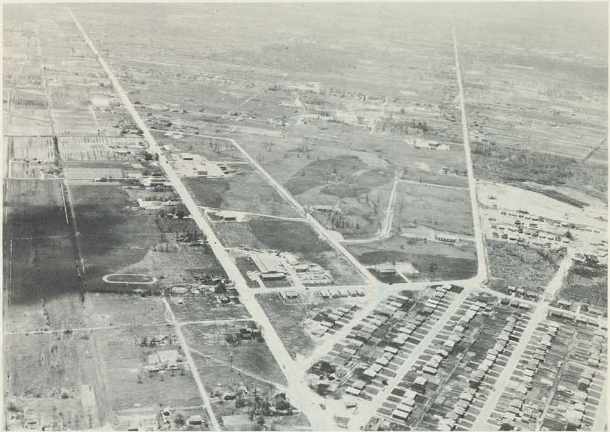
THE SANDWICH WEST INDUSTRIAL PARK IS DEVELOPING RAPIDLY WITH MODERN ATTRACTIVE PLANTS, SUCH AS INTERNATIONAL TOOLS LIMITED, SHERMAN LABORATORIES, ROBOTRON OF CANADA LIMITED, CANADIAN TRAILMOBILE LIMITED, CRESCENT TOOL AND DIE LIMITED AND A. A. FELDMANN WINDOW CO.