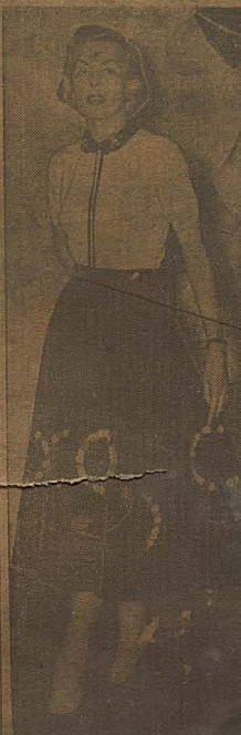
FASHION above. A LaSalle model in a dark dress.