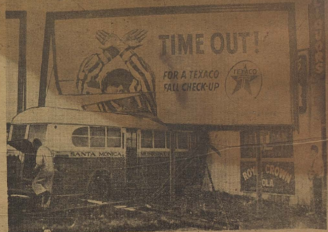
A skidding bus ignored the raised arms in this sign and crashed through it into a West Los Angeles store. Ensuing fire destroyed the store, resulting in minor injuries being inflicted on the

woman inside. The bus was empty at the time, except for the driver who was uninjured when he swerved to avoid a collision.