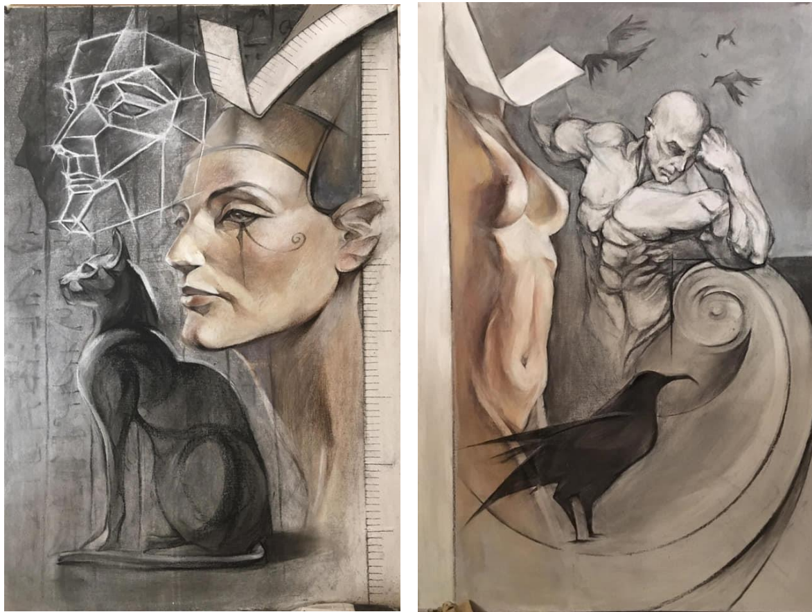
Diptych. 44'x60' Multimedia drawing. Ada Walman.

From length to dimensions, we get measurement by using a ruler; we conclude the rule of the proportions since ancient Greece—the Golden Ratio, Phi, 1.618(“Golden Ratio,”2019), the