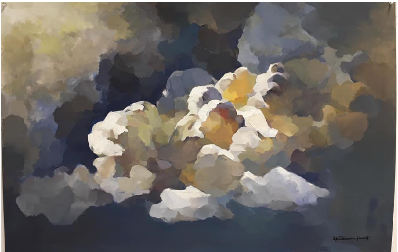
The Colorful Cloud. 24'x36' Acrylic. Ada Walman.