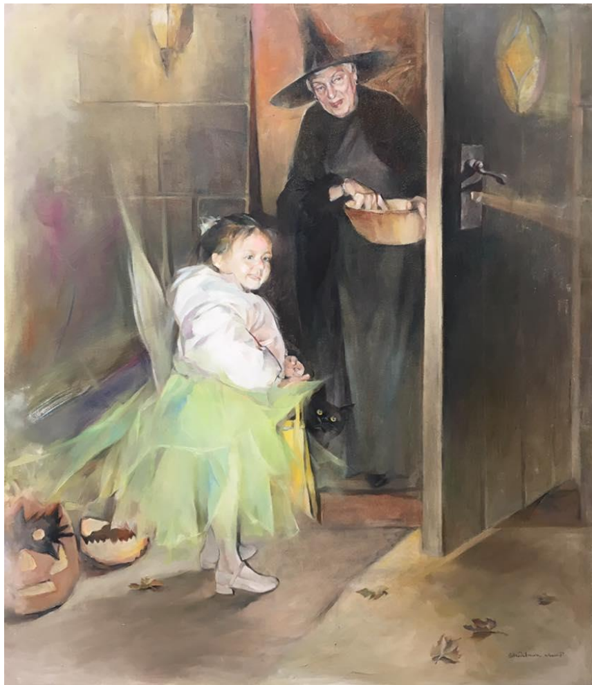
The Warm Night. 40'x46' Oil on Canvas. Ada Walman.

In a dark and cold night, a little angel came to an old witch's door, the flapped wings scattered softly as if glittering Pixie Dust (Disney, n.d.) around. The sweetest smile on her face