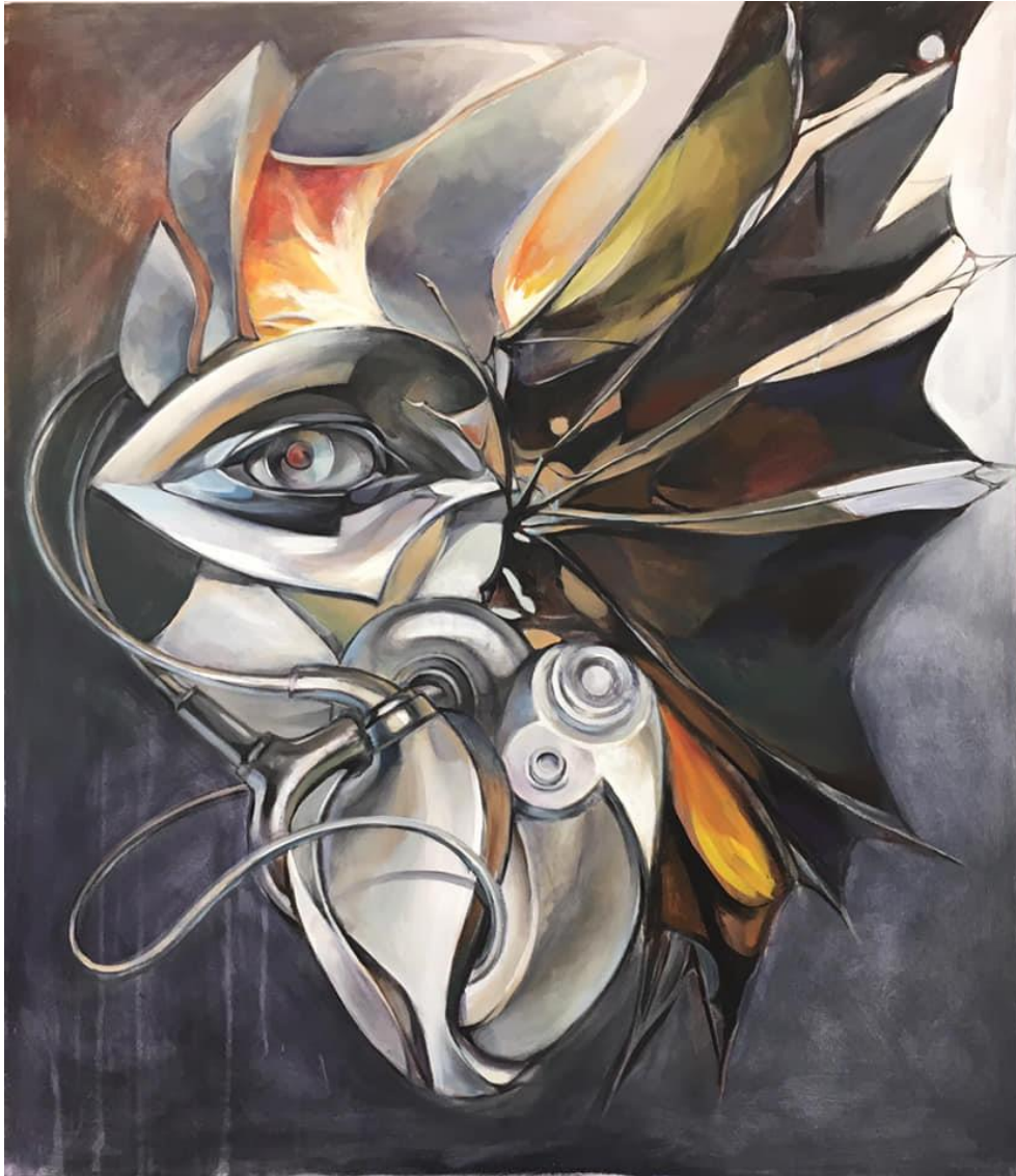
Perpetual Life. 40'x46' Acrylic on canvas. 2018. Ada Walman.

All lives are fleeting compare with the universe. Leaves dry and are too beautiful to last but beautiful still as if butterflies were flapping wings to fly. Our beings, flesh and blood (The free dictionary, n.d.) perish, decay or ashes, can only blend in dirt, dissolve in water or blow in air; Emotionally, death leaves sadness and heart-broken pain to the rest of us to grieve.