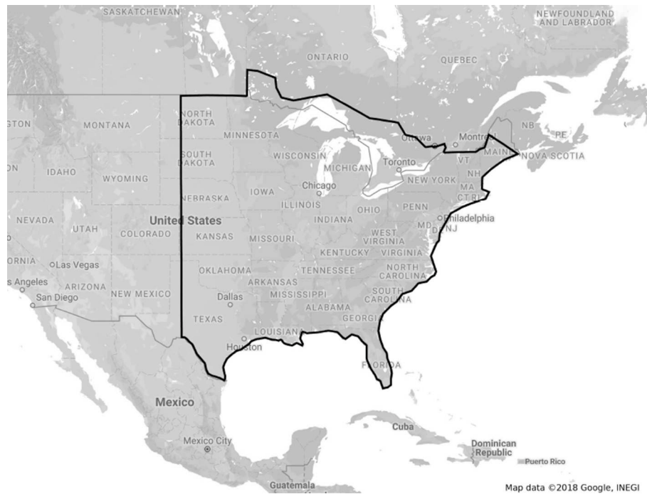
FIGURE 1 | Sampling area. The sampling area includes the 35 eastern-most states of the US and Canada (Ontario), representing all areas where there is more than a 50% probability that monarch populations are present for breeding purposes. Geographically speaking, the US-Mexican Border, parallel 49, meridian 102, and the east coast constitute the southern, northern, western, and eastern limits of the sampling area, respectively.

this the reason to not balance the sample with an iterative proportional fitting or other raking procedure (Kolenikov, 2014); nevertheless, broad generalities to the target population can still be inferred. Respondents' demographics from the main urban residents and monarch enthusiasts' samples are summarized in Tables 1, 2 , respectively.