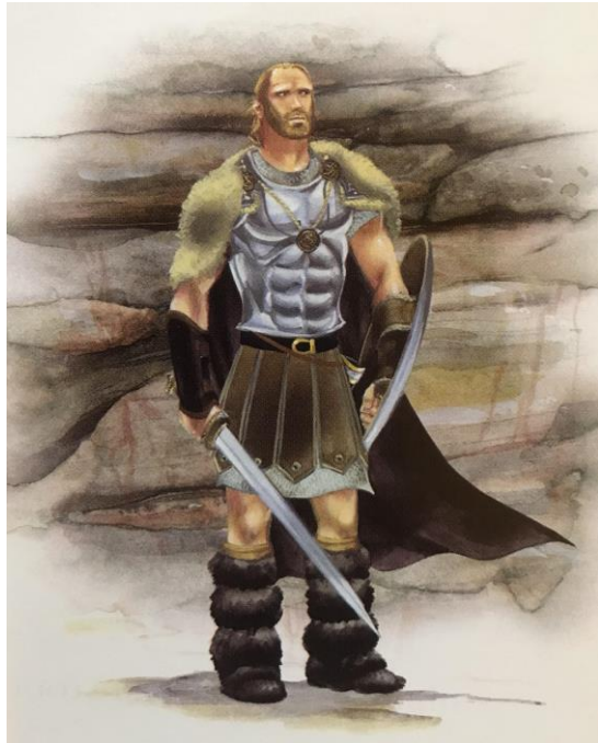
Beowulf (p. 1)