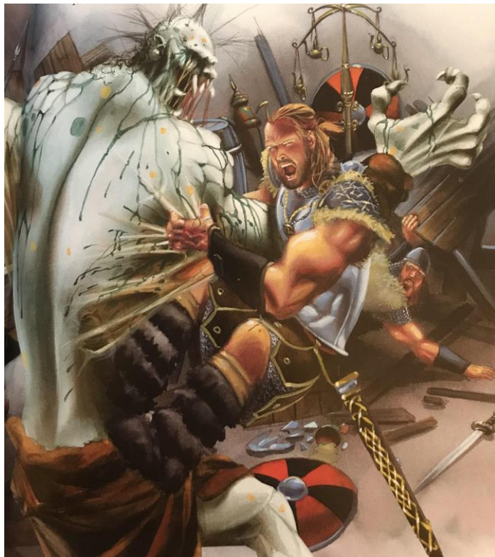
Beowulf and Grendel locked in battle, fighting with bare hands (p. 27)