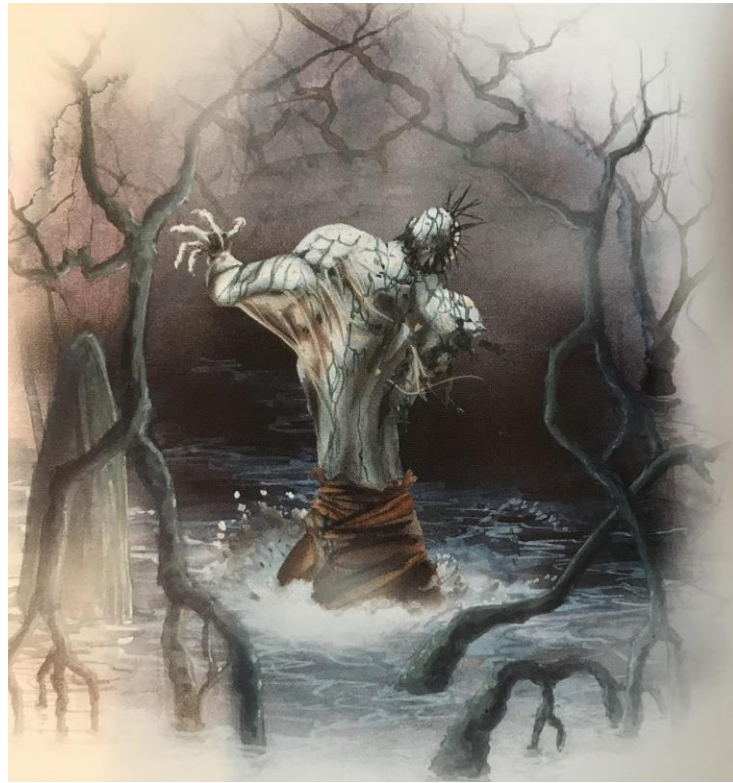
Grendel in retreat with one arm (p. 28)