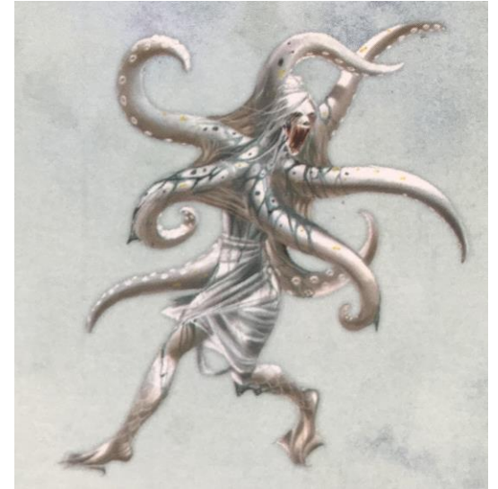
Grendel's mother (p. 2)