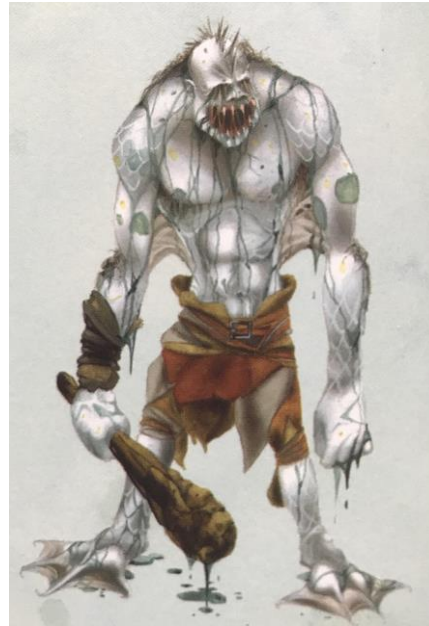
Grendel (p. 2)