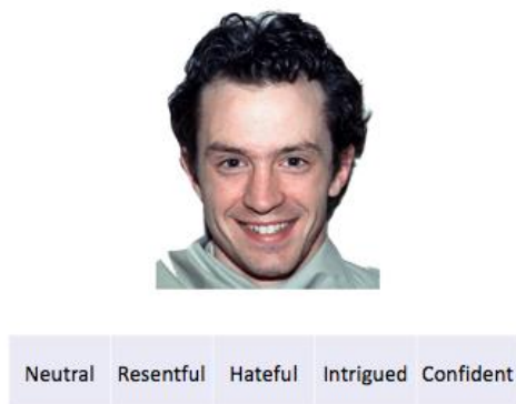
Figure 1. Example stimuli from the Ambiguous Faces Test.

(unhappy) to 9 (happy) such that scores below 5 (neutral) are indication of negative affect, and scores greater than 5 are indicative of positive affect. The words for the AFT were selected such that there was a high negative valence word (valence score between 1 and 2), a low negative valence word (valence score between 3 and 4), a low positive valence word (valence score between 6 and 7), and a high positive valence word (valence score between 8 and 9). The emotion word with which the faces were created (e.g., happy, surprise, sad, or fear) were not be included in the emotion word options to increase task difficulty and require interpretation of valences. Words from each category were randomly assigned to each facial expression (see Figure 1). For the purposes of this study, each word was assigned a value based on its valence category (see Table 1.01).